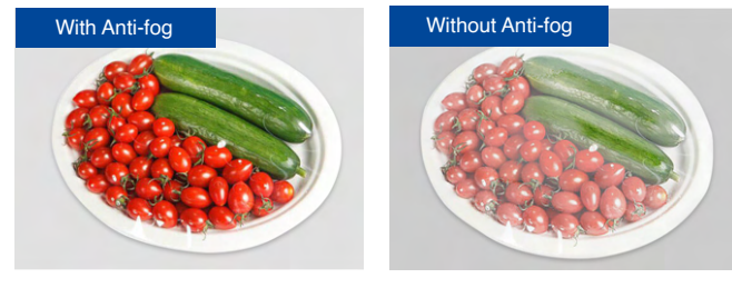
Ideal for shrink packaging of fresh fruits, vegetables, meat, and fresh products.